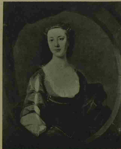
"FLORA MACDONALD"; A PAINTING BY ALLAN RAMSAY (1713-1784).