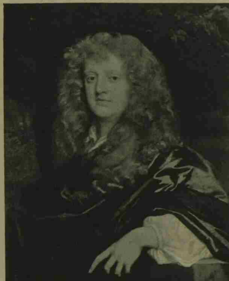
AN UNIDENTIFIED PORTRAIT OF A MAN IN A BROWN COAT AND GREY WIG; BY SIR PETER LELY (1618-1680).