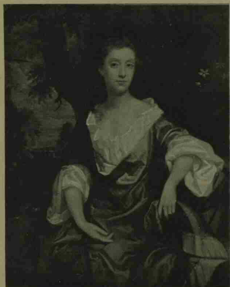
"THE COUNTESS OF OSSORY"; A PORTRAIT BY SIR PETER LELY (1618-1680).