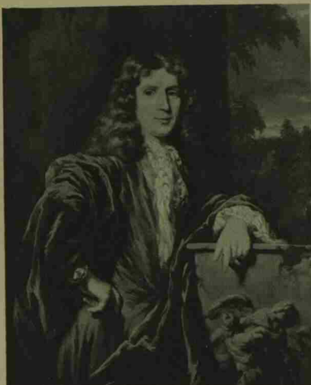
"ARCHIBALD, NINTH EARL OF ARGYLL"; BY NICOLAS MAES (1632-1693).