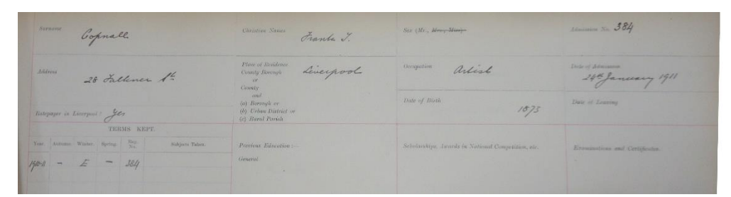
Admissions Register, Liverpool School of Art - 24 January 1911